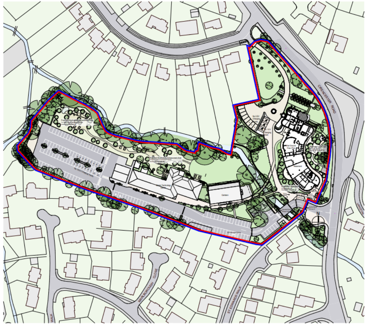
Existing and proposed site plan